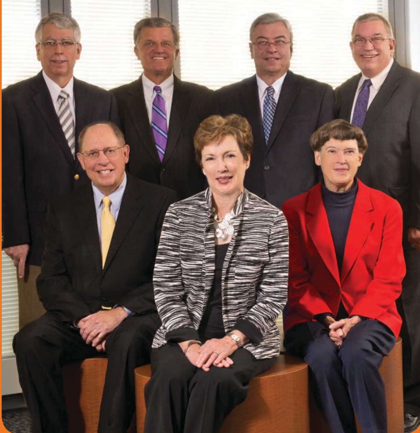
Hancock Regional Hospital Board members from left to right: